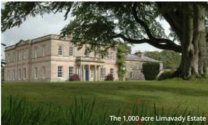
The 1,000-acre Limavady Estate

DAY The North Antrim Coast is one of the great coastal walks, where the Atlantic wears away at this rough-hewn edge of Ireland, the dramatic contours of which contrast strikingly with the pastoral scenes tucked into the serene glens. That would be enough in itself, but the coastline is blessed with an astonishing geological centrepiece: the Giant's Causeway, a UNESCO World Heritage Site. With the Causeway as start or finish point, enjoy a day's walking topped off by a visit to the world's oldest distillery, Bushmills, on the way home.