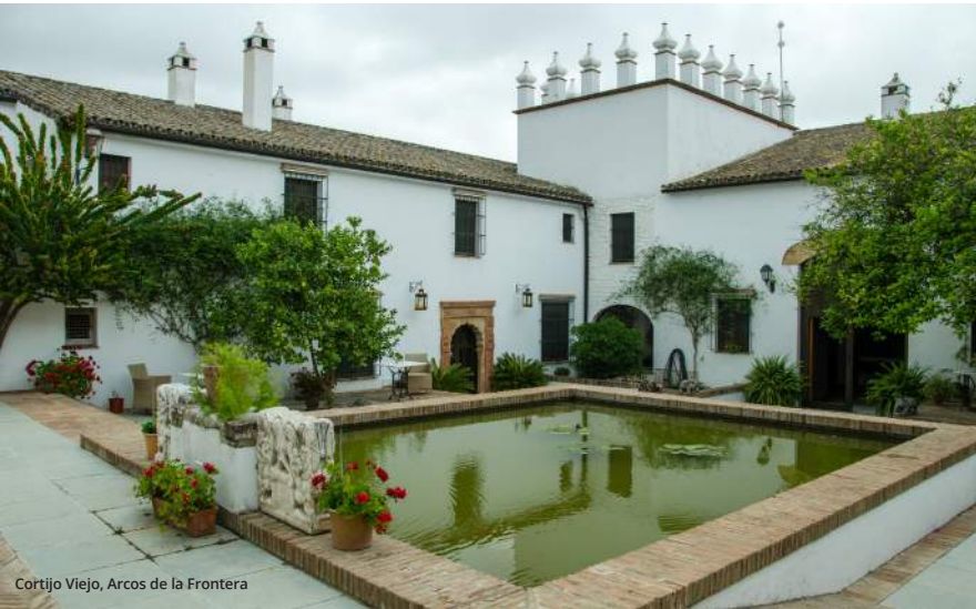
Cortijo Viejo, Arcos de la Frontera

GOOD TO KNOW The region is renowned for its sherry, and a circuit starting at nearby Jerez before passing through Sanlúcar de Barrameda, Chipiona, Rota, and El Puerto de Santa Maria can make for an enjoyable day's tasting.