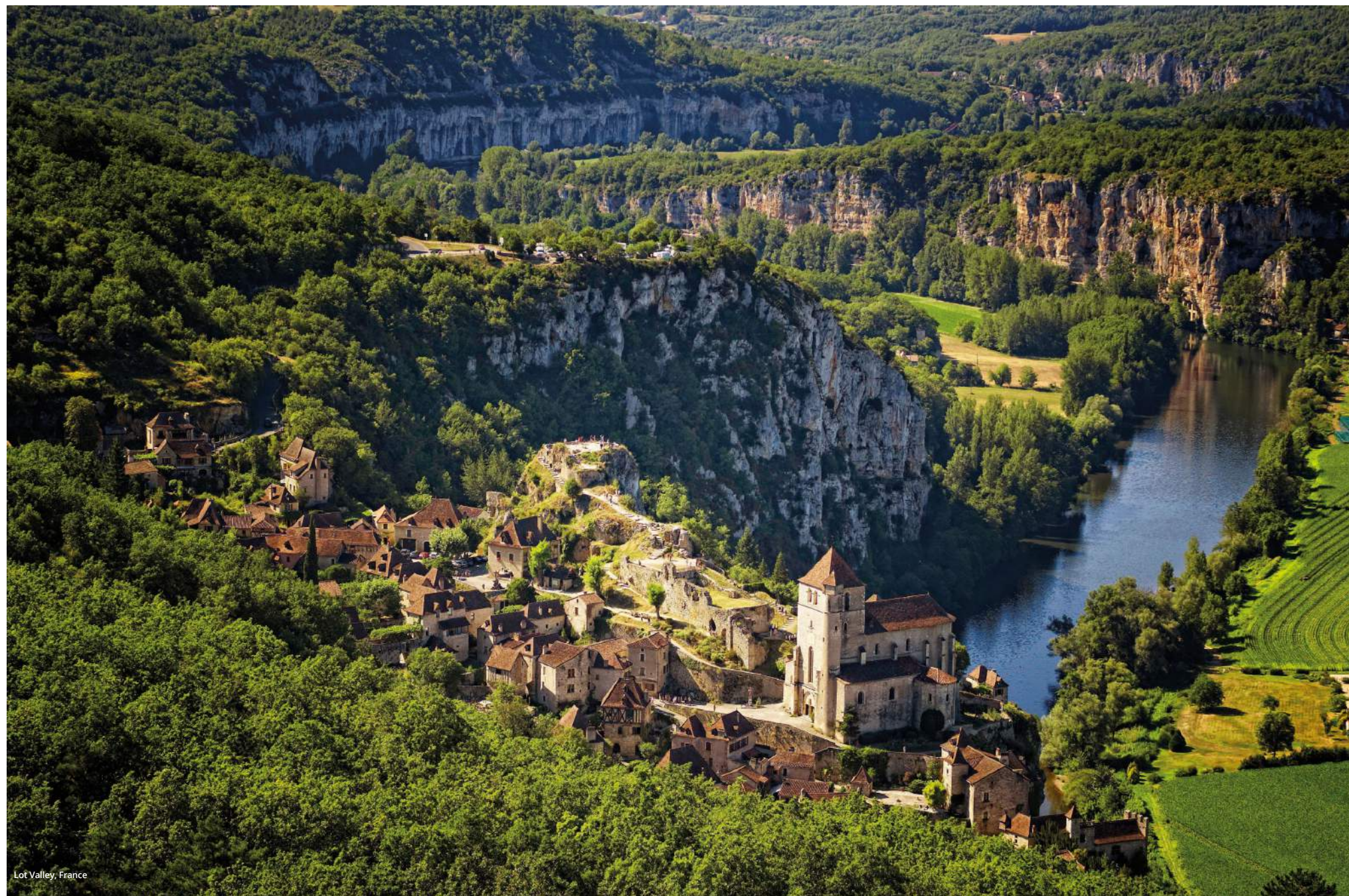
Lot Valley, France

While what makes a successful day trip is highly subjective (gelato; adrenaline; minimal family strife), there are certain fundamentals that underscore every memorable dawn-to-dusk sojourn: a destination worth the trouble; a journey worth the time; and a starting point worth returning to. With these criteria in mind, we've compiled a Europe-based selection for your consideration.