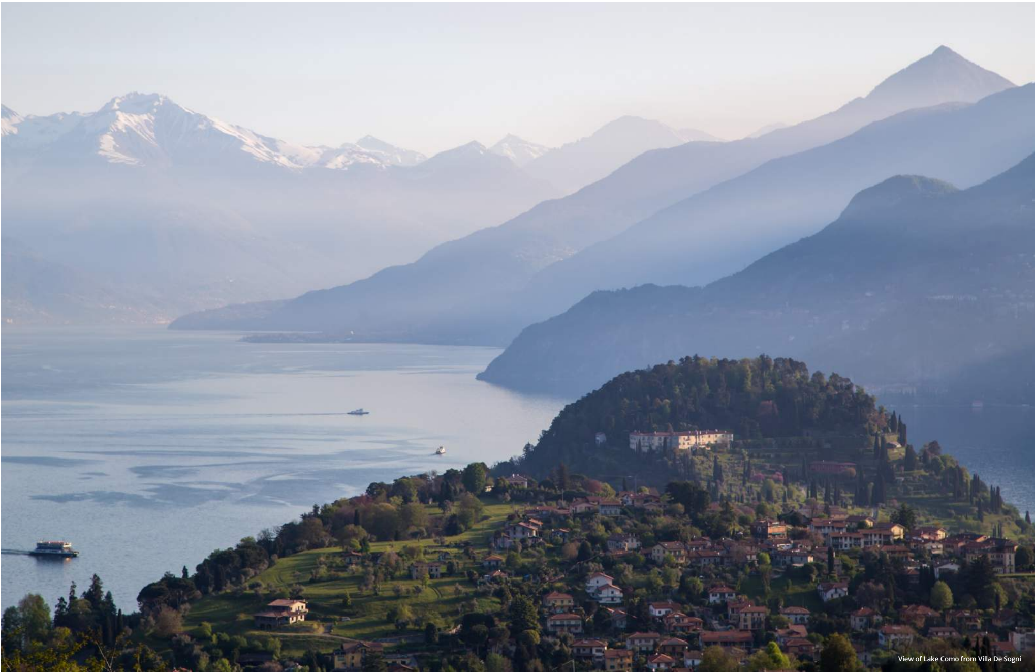
View of Lake Como from Villa De Sogni

GOOD TO KNOW When visiting the Causeway, aim for low tide: much of the Causeway is covered when the tide is high.