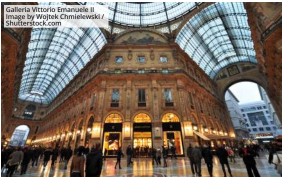
Galleria Vittorio Emanuele II

DAY Reverse the traditional Milanese pilgrimage by staying at Lake Como and day tripping into the city. For bargain hunters